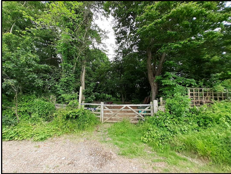
Photograph 13, from the site of the former cattle pens looking across the garden boundary of the claimed route