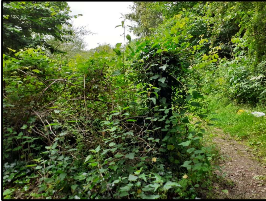
Photograph 5, at point C1 looking north-west