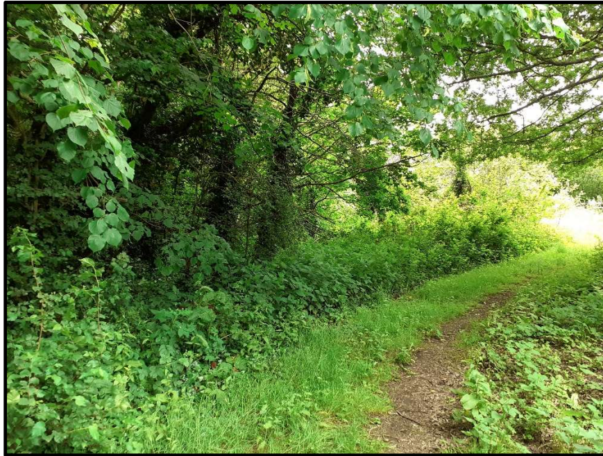
Photograph 7, just after point C1 looking south-east