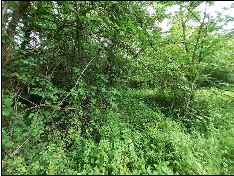
Photograph 9, between C1 and C2, looking south-east